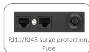
RJ11/RJ45 surge protection, Fuse